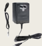
PRS2403 24V DC Power Supply