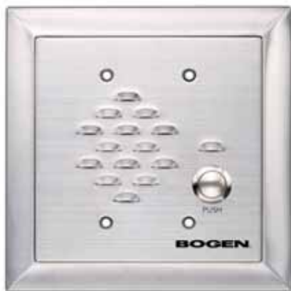
Shown with bezel frame (included)