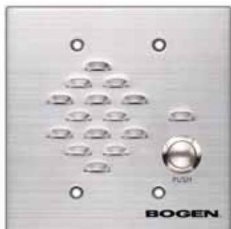
Shown without bezel frame